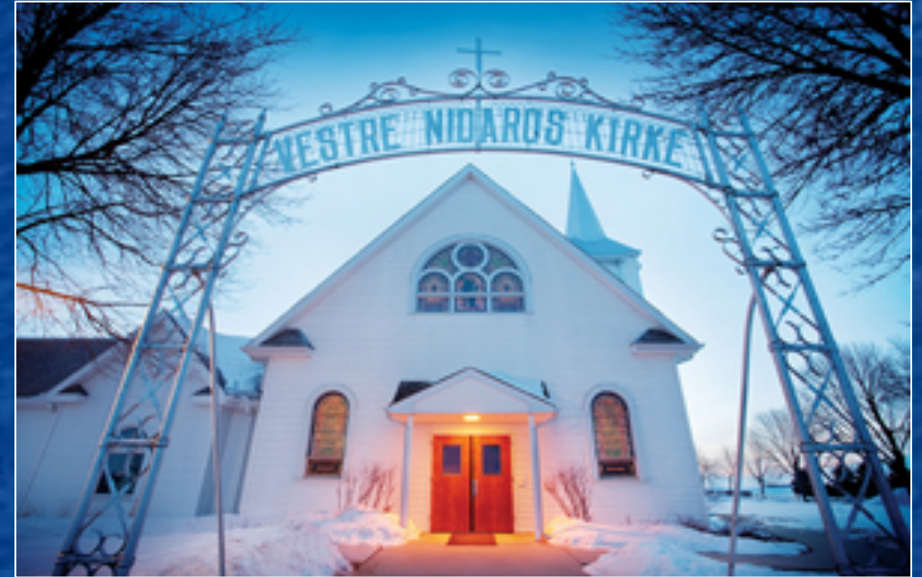
West Nidaros Church South Dakota Completed 1912

The immigrants built four churches named Nidaros, keeping their language alive.