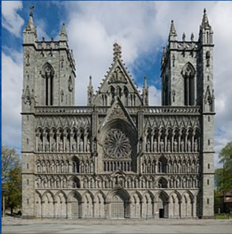
Nidaros Cathedral Trondheim Norway Completed 1300

Famine, starvation, and poverty led 600 settlers to leave Trondheim, Norway, settling north of Sioux Falls.